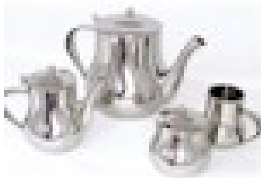
Tea & Coffee sets