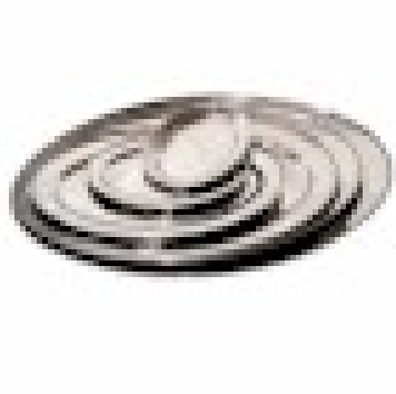
Stainless Steel Serving Dishes